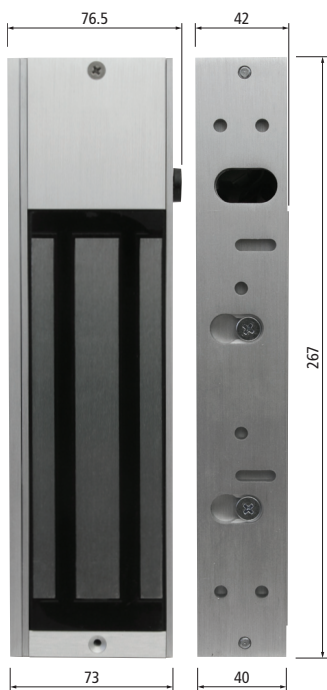
All dimensions in mm