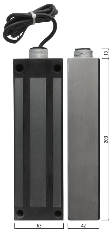
All dimensions in mm