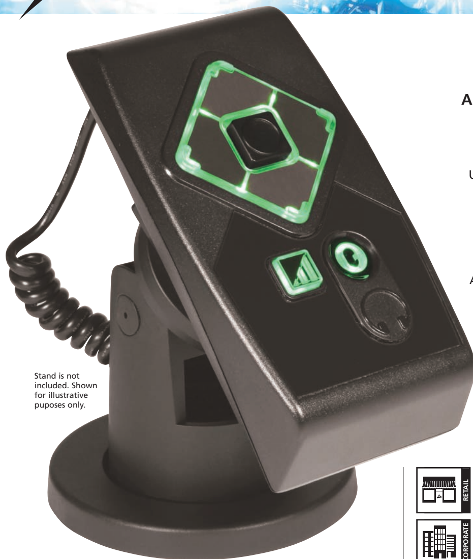
Stand is not included. Shown for illustrative purposes only.