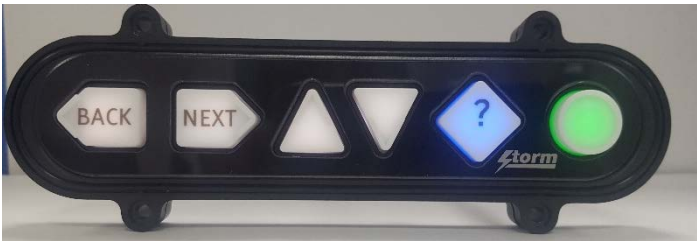
Storm ATP NavBar SF™ Black with White Keys, Under panel Install