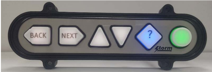
Storm ATP NavBar SF™ Silver with White Keys, Under panel Install